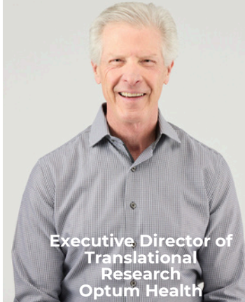
Executive Director of Translational Research Optum Health